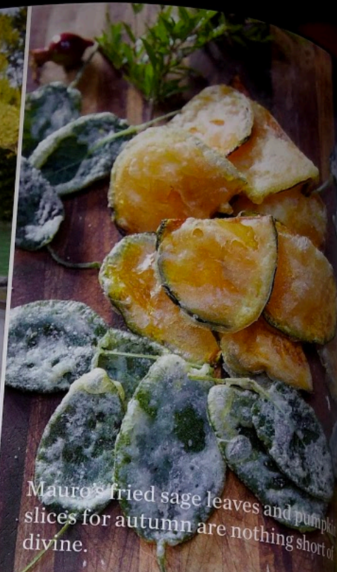
Mauro's fried sage leaves and pumpkin slices for autumn are nothing short of divine.

Erholung pur im Eco-Luxury Style für Gäste dieser grosszügigen Villa auf der Privatinsel Santa Cristina, unweit von Burano.